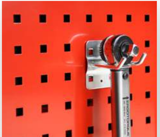
Square perforation for accessories