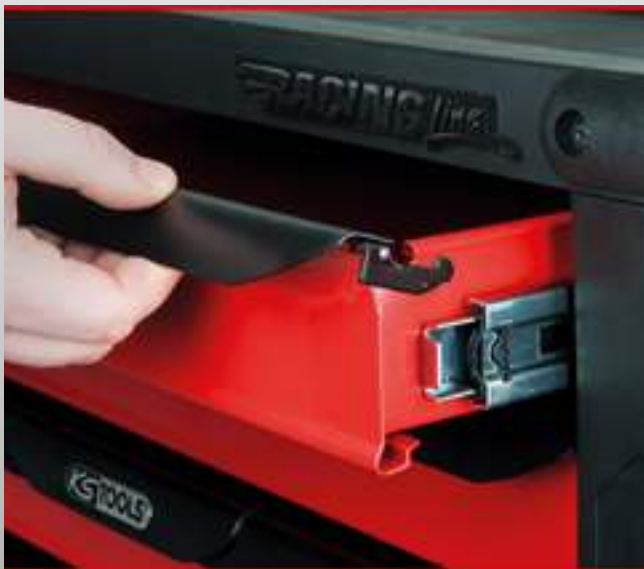
Individual locking prevents unintentional opening