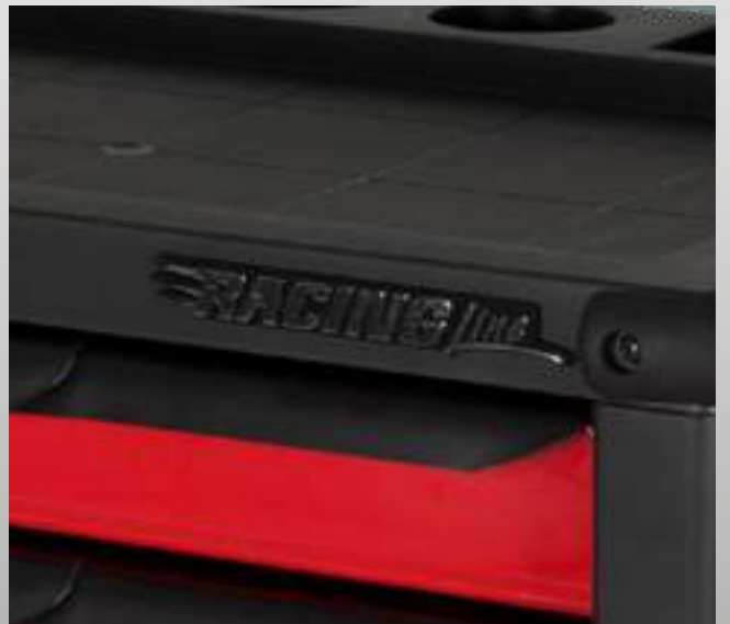
ABS Worktop with compartments for small parts