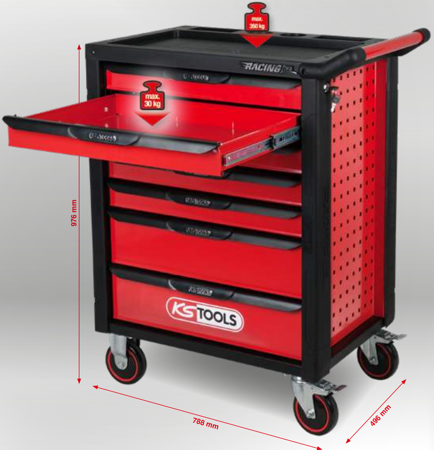
RACINGline black/red Workshop trolley with 7 drawers 826.0007