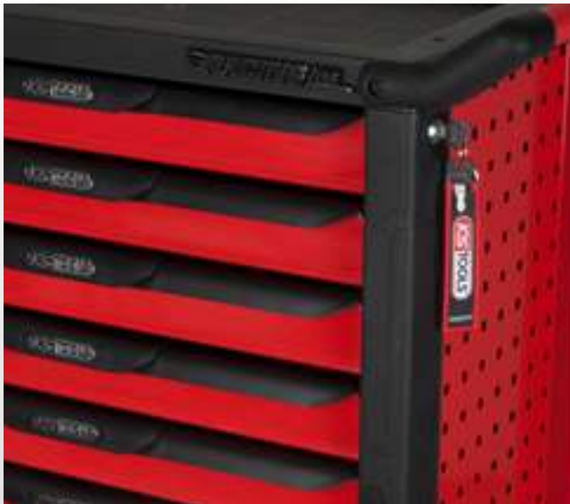
Lockable trough built-in cylinder lock